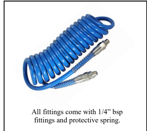
All fittings come with 1/4" bsp fittings and protective spring.