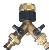
12mm Y Connector