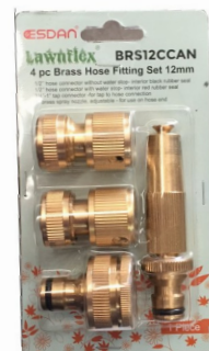
12mm Hose Kit - 34GHK12