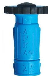
SMALL BODY 1" and 1.1/4" BSP