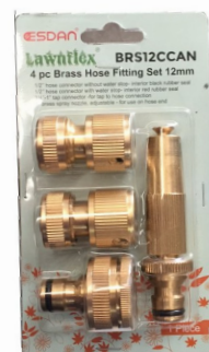
12mm Hose Kit - 34GHK12