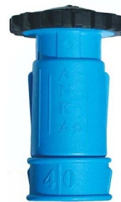
LARGE BODY 1.1/4" and 1.1/2" BSP